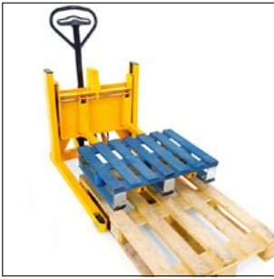
A half pallet is picked up from a standard Euro pallet