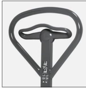
Ergonomic operating handle