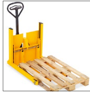
Picking up a standard Euro pallet