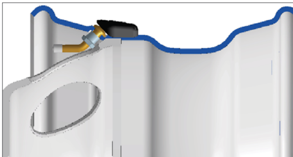
Wheel with DCW-G3